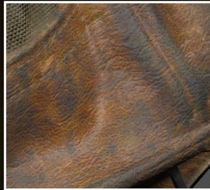
AGED WARM TAN LEATHER