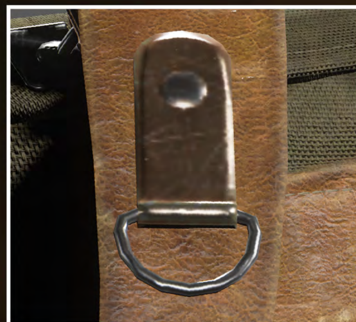
FOLDED SEALED LEATHER AND METAL BUCKLES