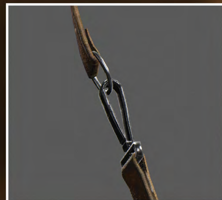
CARABINER CLIPS FOR STRAPS ADJUSTMENT