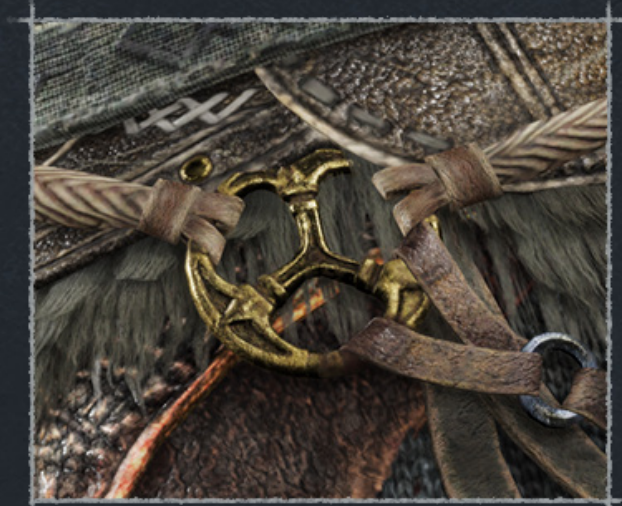
Hey, ain't that the Twilight Pendant?

Another item of Baldur's. Seems she's put it to pragmatic use.