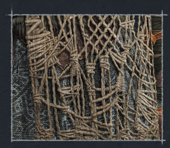
Crocheted wool. Surprisingly warm, when you need it to be.