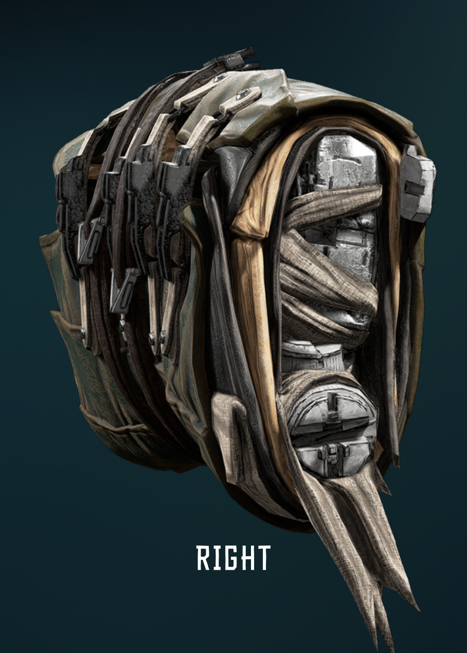
Green dyed full grain leather