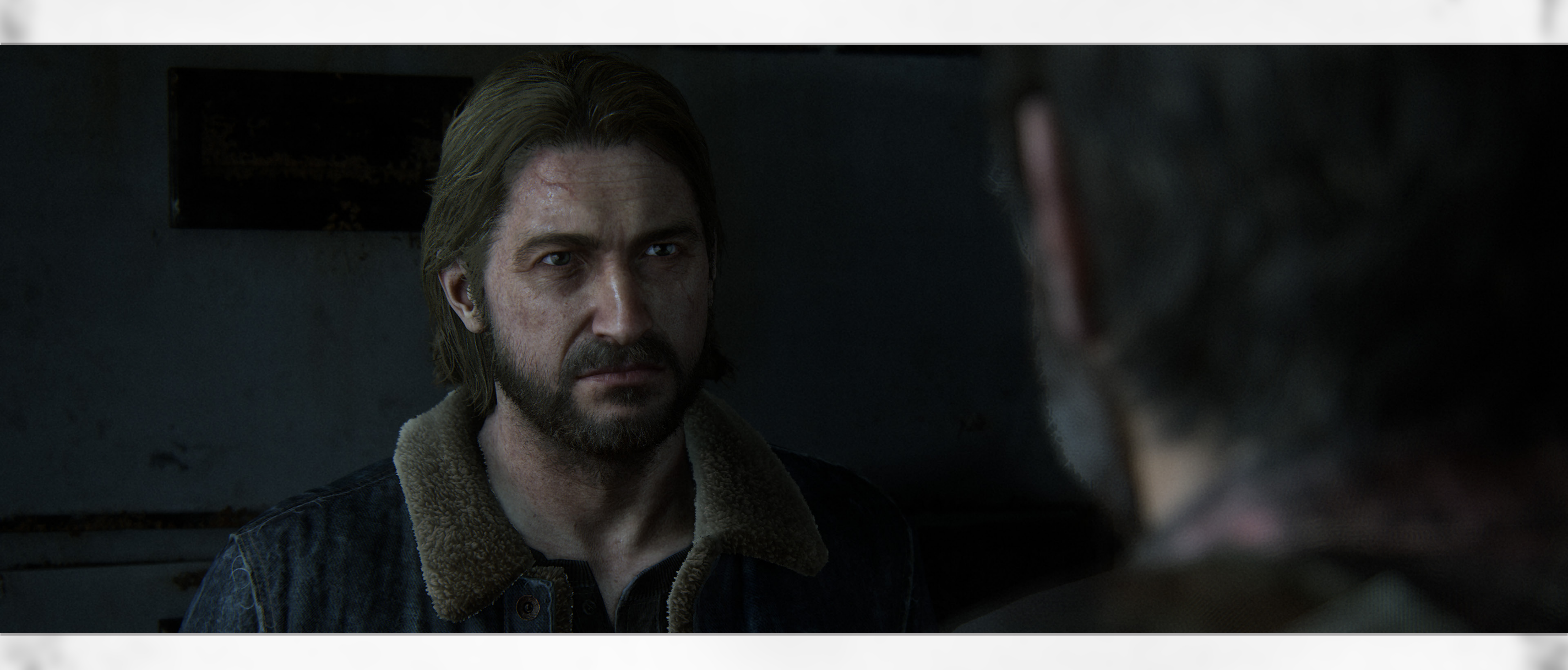
THE LAST OF US. PART I